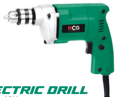
ELECTRIC DRILL RCG-DL-2310