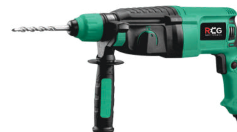
ROTARY HAMMER RCG-RH-2.26