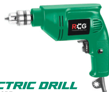
ELECTRIC DRILL RCG-DL-10RE