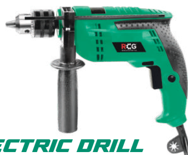
ELECTRIC DRILL RCG-DL-13RE