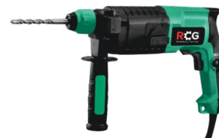
ROTARY HAMMER RCG-RH-2.20